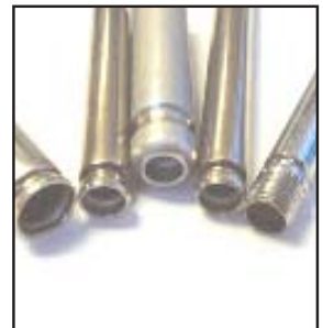
Snap-ring and O-ring grooves

Customize for special grooving process cost effectively